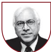
Dr. S. Y. Quraishi Chancellor IILM University, Gurugram Former Chief Election Commissioner of India

Experience the guidance of world-class pioneers on your journey towards education, wisdom, and knowledge. These experts bring vast industry experience in their respective fields, enhancing both the teaching and learning processed.