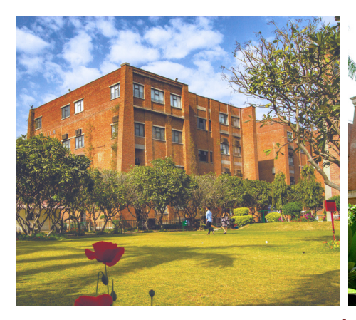
IILM University Gurugram 1, Knowledge Center, Golf Course Rd, Sector 53, Gurugram, Haryana 122003