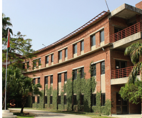
Plot No.16-18, Knowledge Park II, Greater Noida, Uttar Pradesh 201306